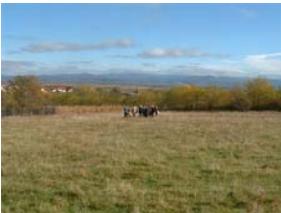
Site for the new Half-way House