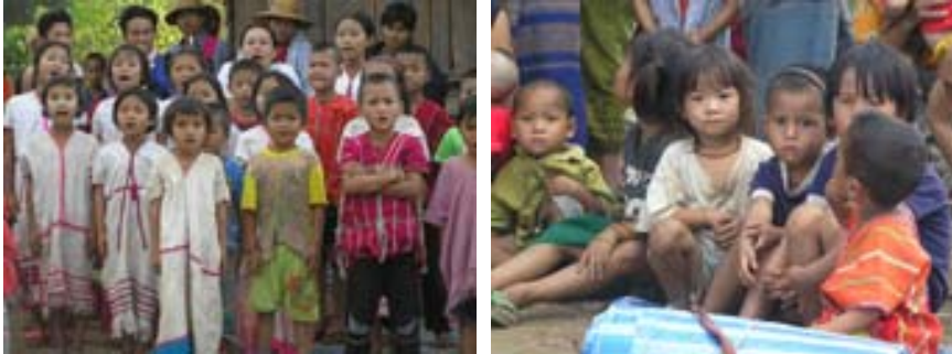
Karen children at the school in Kaw Law Gaw on the Burmese side of the Thailand/Burma border. Photographed last December.